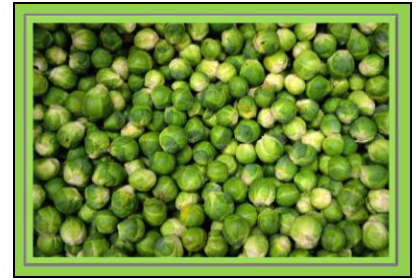
Good buy – Brussel Sprouts

Tomatoes: Coloring of round tomatoes is a bit light. Our buyers are diligently searching the market for the best quality product available.